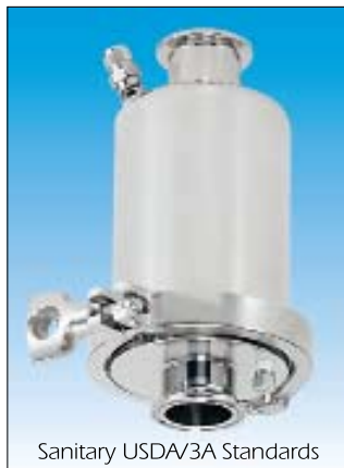
Sanitary USDA/3A Standards

Applications for this housing include sterile venting, sterile air/gas filtration, food and beverage processing, and sanitary applications requiring high purity, non-reactive surfaces. They are also excellent pre-filters used upstream of membrane filters.