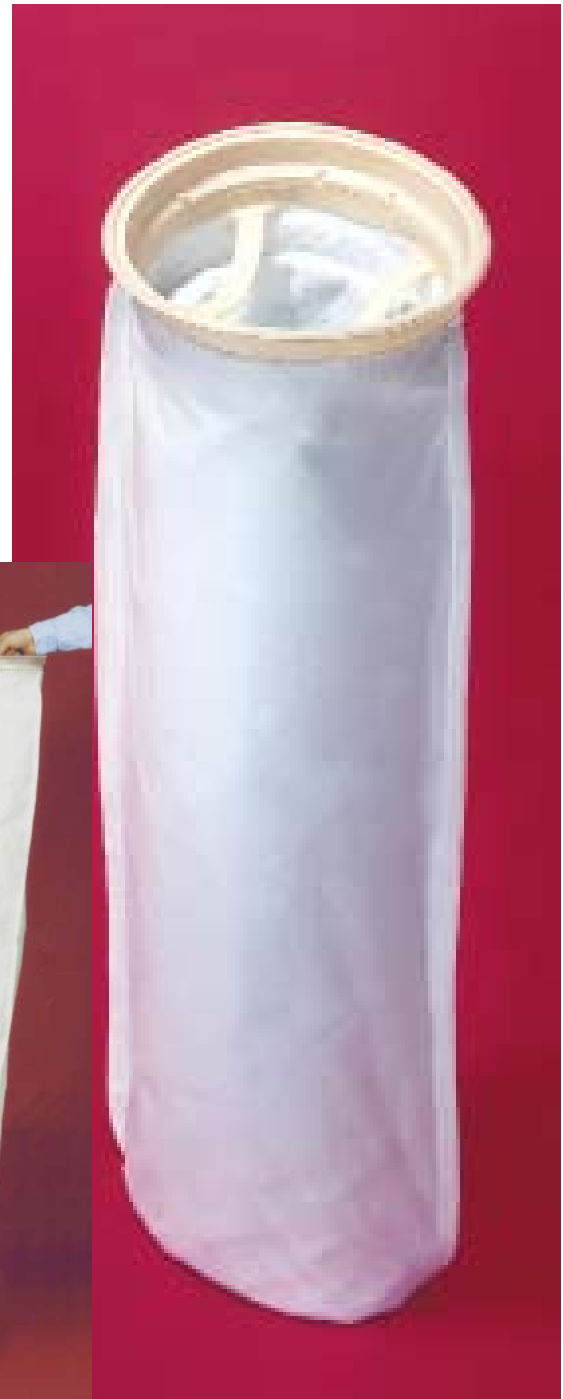
Surfaceplus® bag ready for use.

A bag this long folds into itself twice to fit in our standard Model 8 housing.