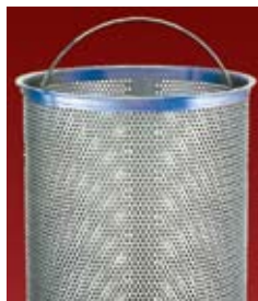
Model CU Replaces Cuno baskets 7PC1, 7PC2