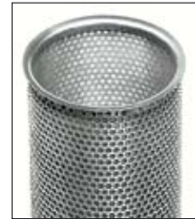
With wire mesh lining

PERFORATED WITH WIRE MESH LINING STRAINER AND FILTER BAG BASKETS: Stainless steel wire is used in mesh sizes 30, 60, 100, 150, or 200. When used as a bag filter basket, the following advantages are realized: