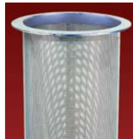
Model RP Replaces Ronningen-Petter baskets 224, 324, 424, 152