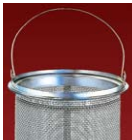
Model STR Replaces Strainrite baskets UF1-90, UF1-180