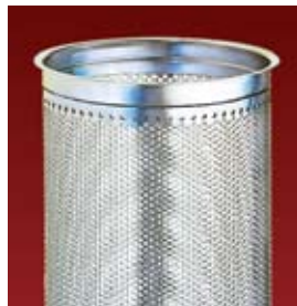
Model FF Replaces Filtration Systems baskets 112, 122