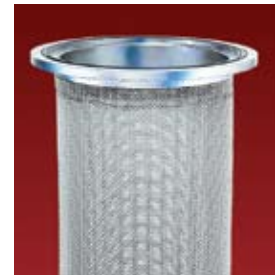
Model AFF/GAF Replaces American Felt & Filter/ GAF baskets 112, 122, AMS R, AMC R, NCX, RBX 1L, RBX 2L