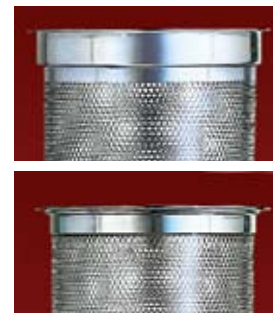
Model FSR or FS Replaces all Filter Specialists baskets