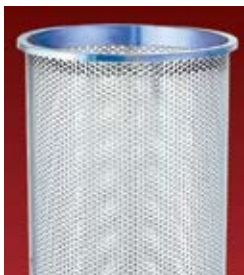
Model CF Replaces Commercial Filter baskets SB11, SB12